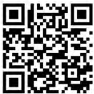
Western RPC Website

Cherie Sawaryn (780) 221-2437 cherie.sawaryn@norquest.ca